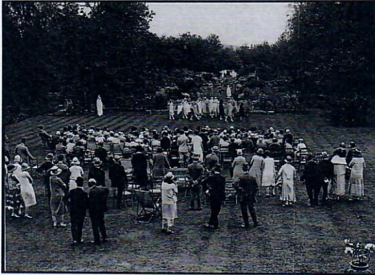
And a Bow was Set in the clouds 1926